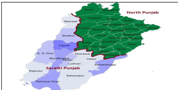
Figure 1: Saraiki Punjab and Northern Punjab (Defined for this paper)

It is important to mention that while comparing the two regions, it would not be fair to consider data related to Lahore and Faisalabad (northern Punjab region) because of a number of reasons: Lahore is not only an extremely populous city but also the provincial capital, so one cannot compare it with any backward city. Lahore and Faisalabad are highly industrialized as compare to any other city in the Punjab. Furthermore, if these two cities are included in the comparison, the population equation established between these two regions will become highly unequal, which will further decrease the reliability of the comparative analysis. By excluding Lahore and Faisalabad, districts selected for the comparison become easily comparable vis-à-vis their population size. It may help to develop the ratio of the per capita facilities available. The two regions of northern and Saraiki Punjab (defined for this paper) are shown in the following map.